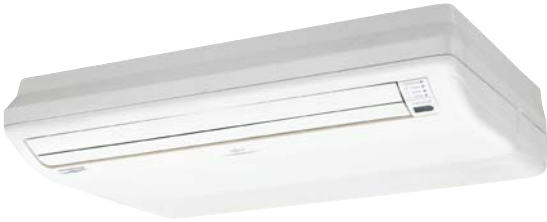
Right and left